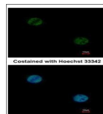
Immunofluorescence analysis of paraformaldehyde-fixed HeLa, using FOXA1 (GRP458) antibody at 1:1000 dilution.